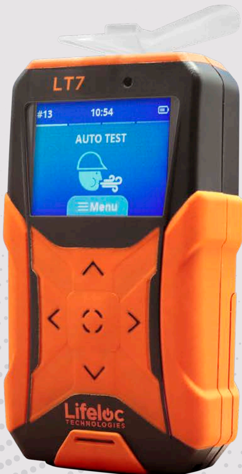
Not shown at actual size